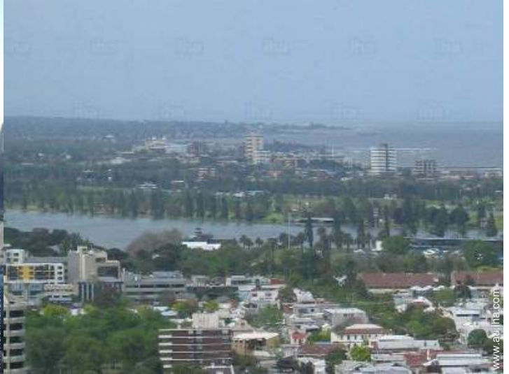
view over the lake