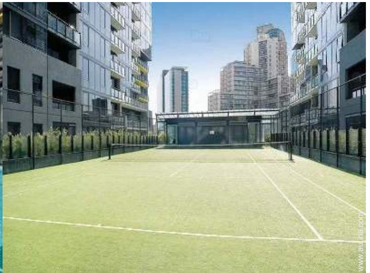
Tennis - synthetic surface