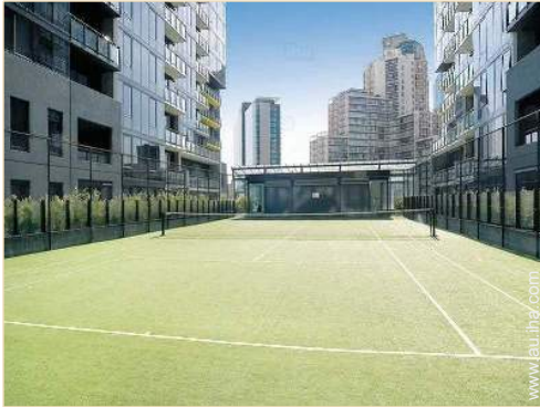
Tennis - synthetic surface