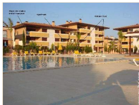
Rectangular swimming pool