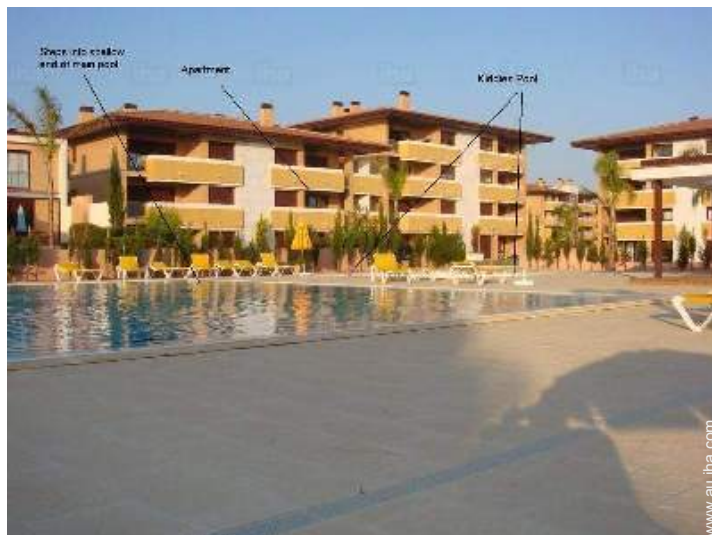
Rectangular swimming pool